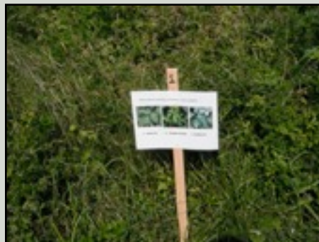
One stage of the hunt