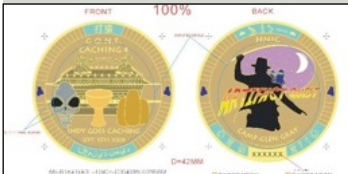
GONE 4 coin (above)

The 2011 G.O.N.E. coin Artwork will be available soon and will be posted on the NNJC.org site. Please