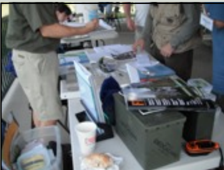
The Geocaching Booth

all day long from people who were interested in geocaching. Big thanks to all those who attended and helped out at the booth, especially Old Navy who organized the event.