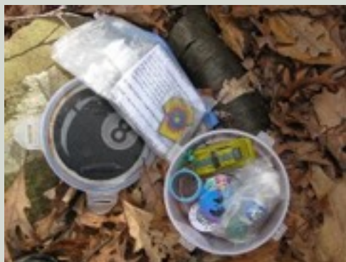
The cache

knowledge and skill to complete, yet is solvable by the general geocaching population. To make things even better, the quality of the cache doesn't rely on the puzzle either--the hike to the cache was great as we passed a waterfall and a small creek. The hide itself is perfectly suited for the puzzle, and without giving too much away, asks for some bravery on the finders part.