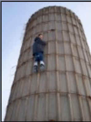
CRdude at a well known cache