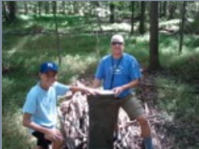
At Mo Cannes along the Passaic!